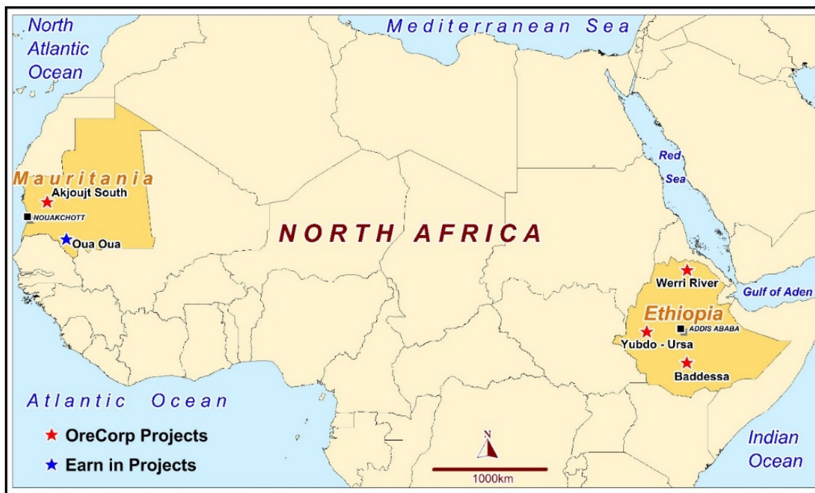
Figure 1: Project Location Map

During the year, OreCorp continued to assess advanced projects and corporate opportunities throughout Africa, with a reconnaissance drilling program completed at the Yubdo – Ursa Project ('Yubdo – Ursa' or 'Project') in Ethiopia and various field activities completed in both Ethiopia and Mauritania ( Figure 1 ).