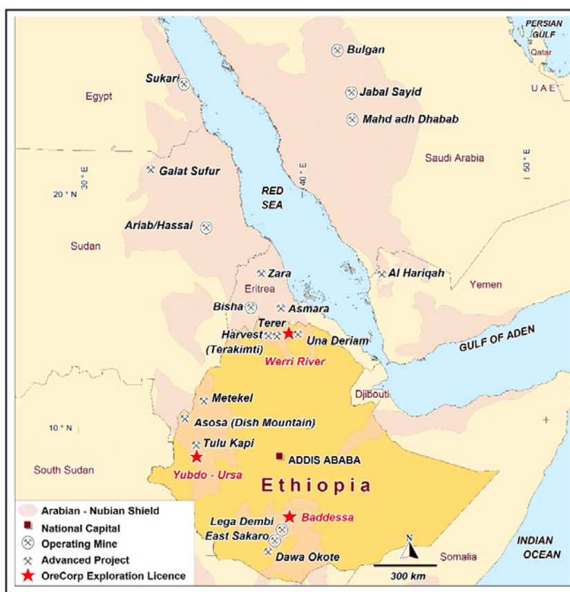
Figure 2: Location Map of Ethiopian Project Areas

Work completed during the year at the Yubdo West Prospect included interpretation and integration of trench assays and completion of a RC drilling program. The infill soil sampling program over the regional prospects YUR2, 3, 4 and Tulu Kapi South was completed as well as a helicopter-borne magnetic and radiometric survey of the Project area. Key results from the work completed at Yubdo – Ursa during the year include: